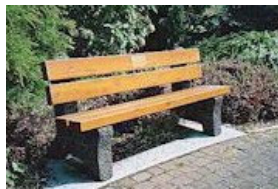
Exposed aggregate grey concrete legs, cedar back and seat (not an exact replica)