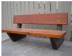
Rustic Bench Cedar Seat and back (not an exact replica)