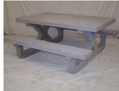
Concrete picnic table