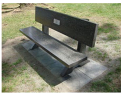
Smooth grey concrete legs back and seat (not an exact replica)