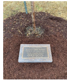
Living Memory Tree